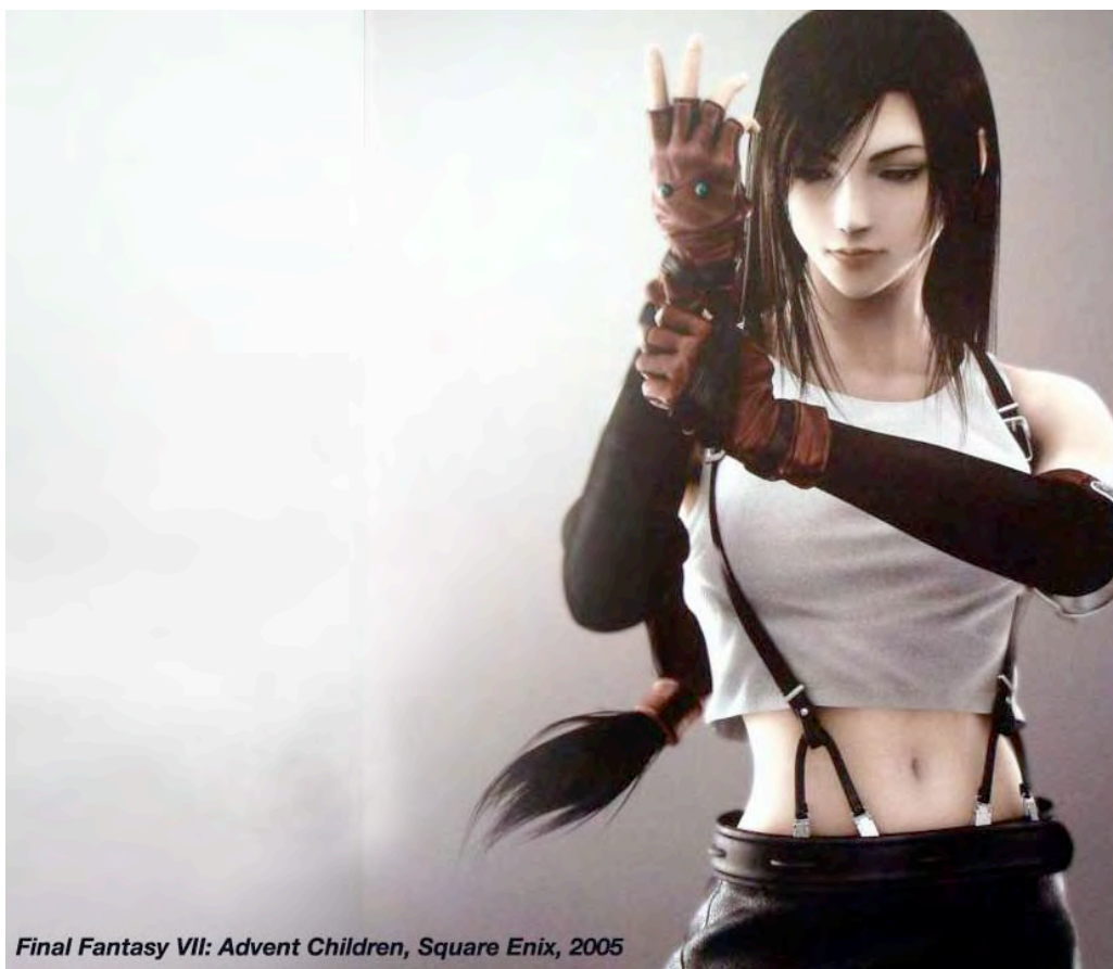
Final Fantasy VII: Advent Children, Square Enix, 2005

FRAMING THE PROJECT: This project locates itself at the intersection of a number of pressing issues for contemporary society, and simultaneously in an interdisciplinary and multi-medial space between several academic fields of inquiry. In its most general form, the central thread of the interlinked sub-projects is concerned with the matrix of relationships between evolving conceptions of politics, literacy and technology (particularly digital technology). In each case, first and foremost, the concern is with the way in which these shifting categories interact with, challenge, and actually constitute the 'humanity' of individuals in contemporary society and the way in which they interact politically