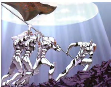
Neon Genesis Evangelion, Anno Hideaki (Gainax, 1995)